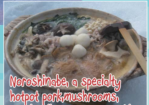
Noroshinabe, a specialty hotpot pork, mushrooms, and locally grown vegetables.