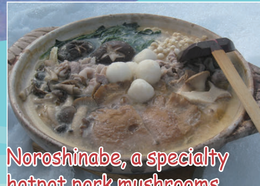
Noroshinabe, a specialty hotpot pork, mushrooms, and locally grown vegetables